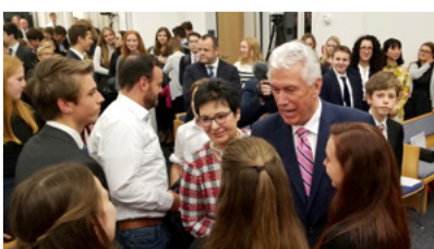
Elder and Sister Uchtdorf also met with the youth. "When you come to the temple, always think of Jesus Christ and what He means to you!" Elder Uchtdorf said.

A dedication of the house of the Lord is a time of joy. It is a time of gratitude.*