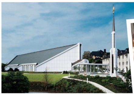
The temple was closed so it could be renovated (repaired). Afterward, it had to be dedicated again.

The Apostles minister to people around the world and teach them about Jesus Christ.