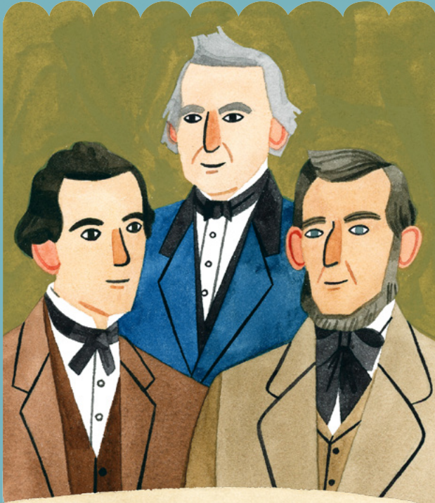
RIKAM OOL RO JILU

“Bwe kōmin lo im jeje kaṃool bwe men kein remṃool.”