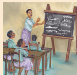
Ekar juon rūkaki ilo Liahona College eo, juon high school ilo Tonga an Kabuñ in.