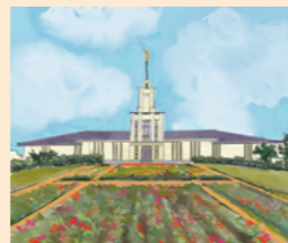
Ekar jermal āinwōt būreejtōñ eo an Nuku'alofa Tonga Tampeļ eo.