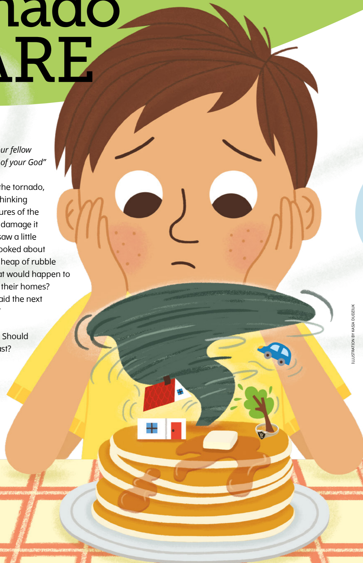
ILLUSTRATION BY KASIA DUDZLUK

“Lots of damage from the tornado,” he said. “Thousands