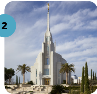
2. Rome Italy Temple