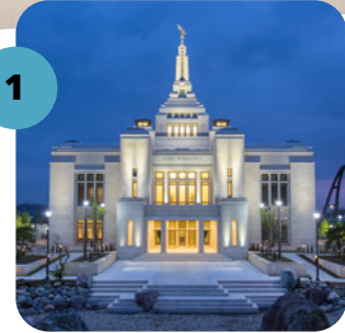
1. Sapporo Japan Temple

Each temple is beautiful inside and out. But the most important thing is what happens inside! Can you match the outside of each temple with a picture from inside?