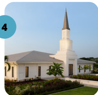
4. Kinshasa Democratic Republic of the Congo Temple