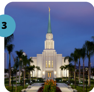
3. Rio de Janeiro Brazil Temple