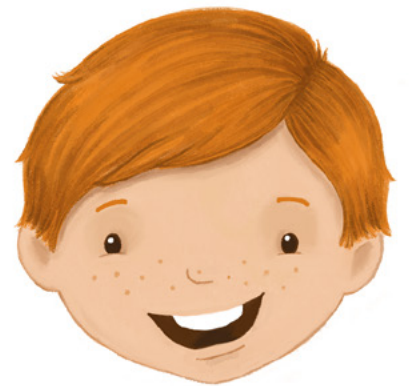
Jein im jatin ɓaddik