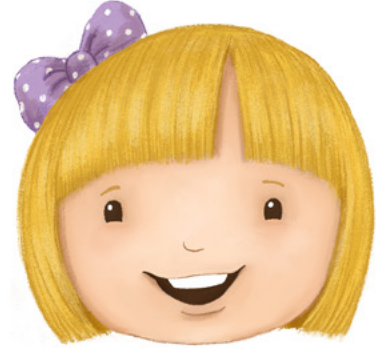
Jein im jatin leddik