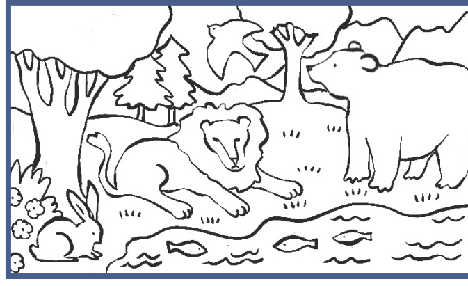
Iesus made the world beautiful with trees and flowers. He made fish, birds, and animals.