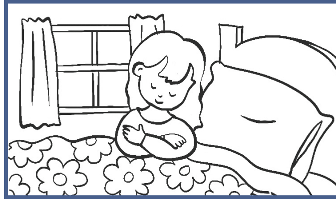
Heavenly Father loves me and watches over me.