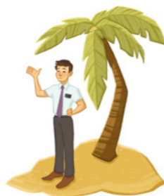
He served a mission on islands off the coast of Spain, Portugal, and Africa.