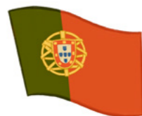
Portugal is a country in western Europe.

Church Magazines (Based on a true story)