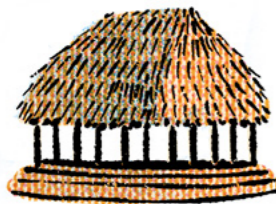
A traditional house in Samoa, called a fale , has no walls.