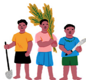
Tom's village, Sauniatu, was built by a group of Latter-day Saints.