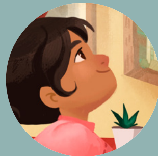
ILLUSTRATION BY ALYSSA PETERSEN