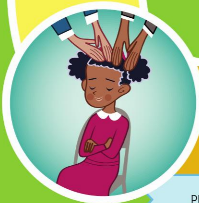
PRESEN WE I TABU SPIRIT

Sakramen—riniu, evri wik, long kavenan blong baptaes