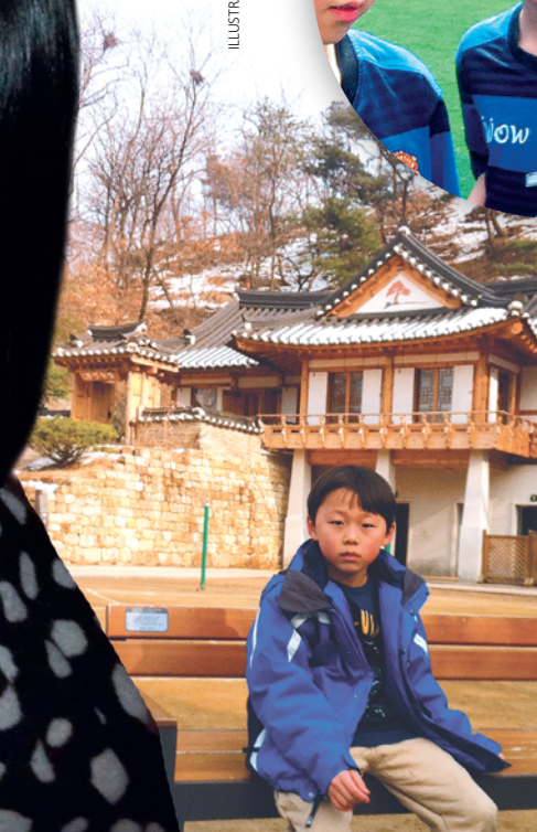
ILLUSTRATION BY BRAD TEARE

Chuseok is one of our biggest holidays. It is a celebration of the harvest—a Korean Thanksgiving.