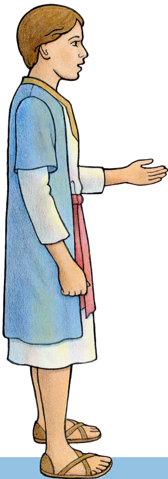
Iesu, ana ririki 12

Ko kona ni kaotinakaoui riki kaobiina i liahona.lds.org.