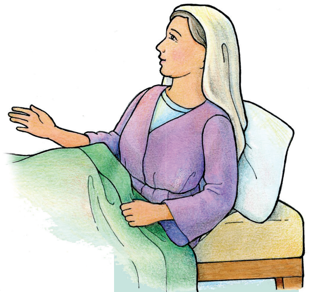
Tina o le Toalua o Peteru