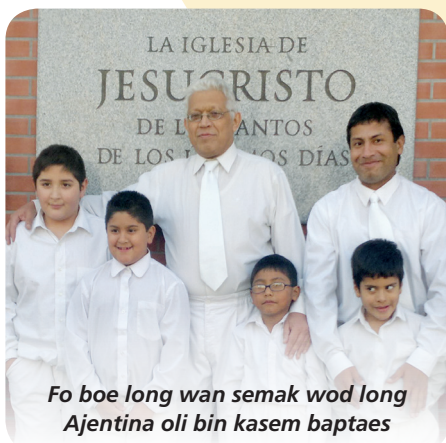
Fo boe long wan semak wod long Ajentina oli bin kasem baptaes long semak dei. Bisop blong olgeta (long medel) i stanap wetem olgeta.