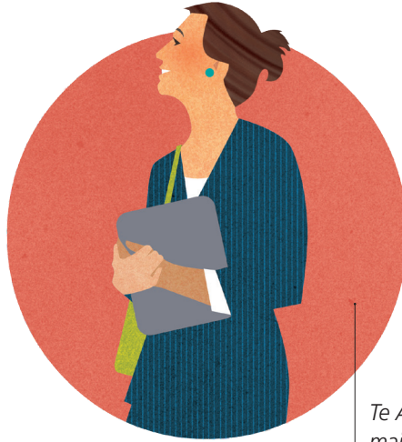
Te Atua e kakabwai maiura n tatabemaniira nako (taraa Taian Areru 145:9). Ti kona n teimatoa n ataa Ana nanoanga inanon maiura.