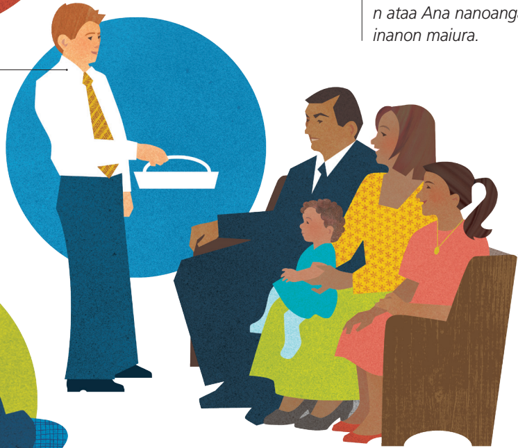
Ni kateimatoai ara taratara iaon te Atua tiaki tii teuana taina n riki. Ti riai ni karaoa ao n teimatoa ni kawakin berita aika tabu, n arora n tau ni kanakin te toa ni katoa wiiki.