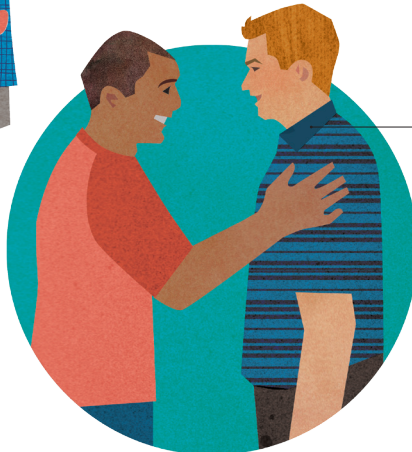
Beretitenti Gordon B. Hinckley (1910–2008) e kaungaira bwa ti na “taekina raoiroin temanna ma temanna nakon are ti na taekina kairuan temanna” ao n “tituaraoi riki n taekina te raoiroi ao te konabwai.” 4