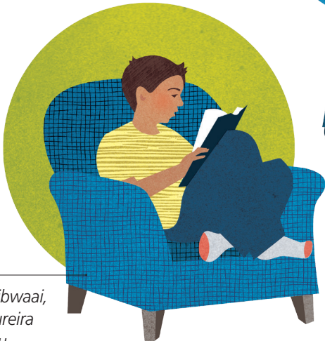
Ngaira, n aron Nibwaai, ti kona ni kakukureira ni booki aika tabu (2 Nibwaaii 4:15–16). Warekan ana taeka te Atua ao Ana burabeti e na karikirakei nanora.