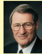
Beretitenti Russell M. Nelson, Beretitenti n Katengaun ma Uoman n Abotoro, “Maiu iroun Kakawakin te Tamnei,” Ensign , Nov. 2000, 17.

“N amwarake e nano riki nakon katoonga. N amwarake e nanonaki nakon kakukureiko. Ti katongii booki aika tabu man kamatebwaiaana inanon kukurein te tamnei n kunei ao kakaonimaki n ongotaeka. Ngkana ti kakukureira n ana taeka Kristo, a . . . riki n kakawaki n mwakoron aroarora.”