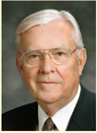
By Elder M. Russell Ballard Of the Quorum of the Twelve Apostles