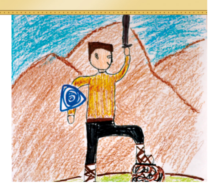
Grant L., age 10, Florida, USA