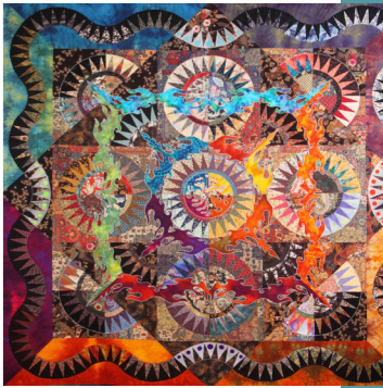
Kazuko Covington, Lalolagi e leai se Mutaaga (tagai Mose 2), Iapani