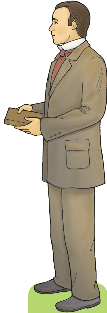
Parley P. Pratt

Imwiin bairean te Ekaretia, te Tama are i Karawa e tangiriia aomata ni kabane bwa ana ongora taekan te euangkerio. Te moan ni mitinare bon tarin lotebwa Timiti ae Tamuera. Hyrum, tarin lotebwa ae a ikawai riki, e reireiniia naba tabeman taekan te euangkerio. N te bong teuana te mwaane ae arana Parley P. Pratt e tuanga Hyrum ae e a tia ni wareka ana Boki Moomon ni kabanea te bong anne. Hyrum e reireinna taekan riki te Ekaretia, ao e bwabetitoaki. Imwiina e nako ni mitinare Parley! E riki bwa te tia kairiiri n te Ekaretia.