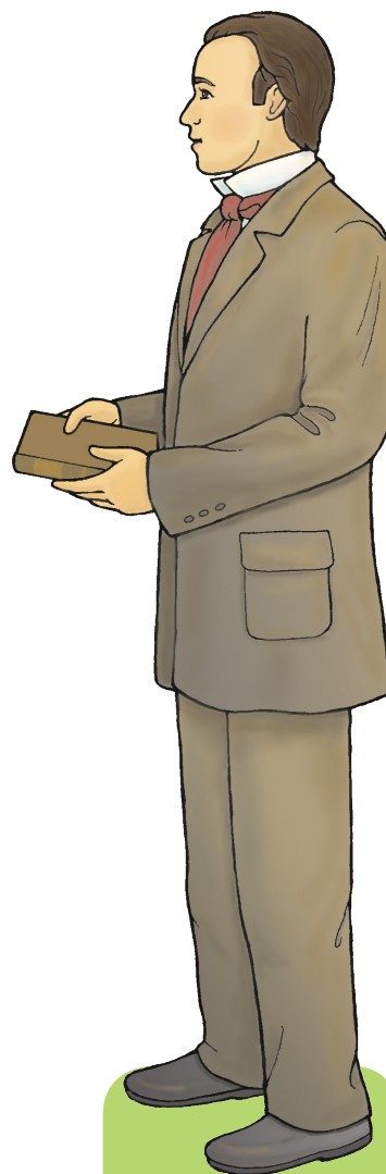
Parley P. Pratt

Ālkin an kar Kabuņ in jutak, Jemedwōj Ilaņ eaar kōņaan bwe aolep ren roņ kōn gospel in. Mijinede eo jinointata ekar Samuel brother eo an Josep Smith. Hyrum, brother eo erūtto an Josep, ekar barāinwōt katakin ro jet kōn gospel in. Juon raan juon emņaan etan Parley P. Pratt eaar jiroņ Hyrum ke eaar mađ aolepān raan eo im riiti Bok in Mormon. Hyrum eaar katakin e eļapļōk kōn Kabuņ in, im eaar peptaiji e. Innām Parley eaar jērbale juon mijen! Eaar erom juon mijenede an Kabuņ in.