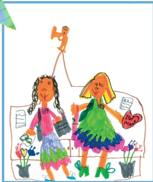
Salome W., 6 tausaga, Quebec, Kanata