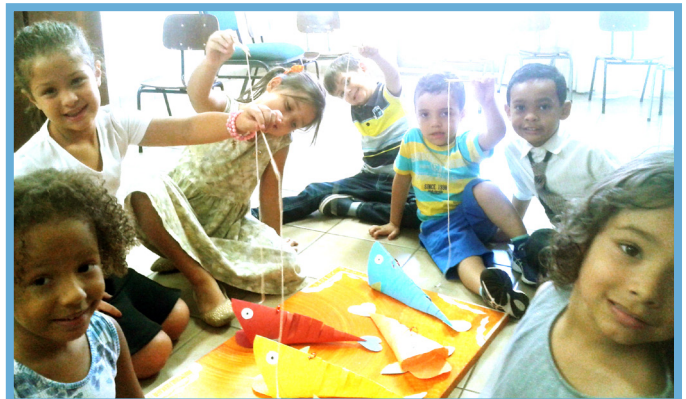
Sa aoa e le vasega CTR 3 i Sao Paulo, Pasila, e uiga i feagaiga o le papatisoga a o latou maua savali, upusii, ma mau i totonu o gutu o i'a.