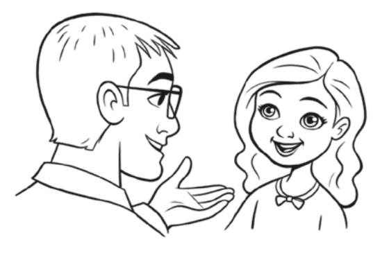
Talk about the temple with someone who has been inside.