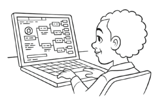
Find someone in your family tree who hasn't been baptized yet.