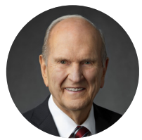
I Kam long Presiden Russell M. Nelson