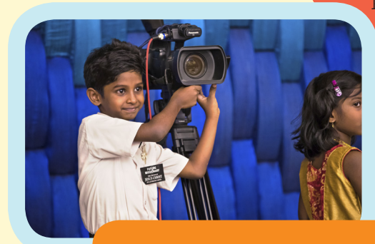
Ni kabane a rangi ni kukurei n ongo ana koaua ana Abotoro te Atua!