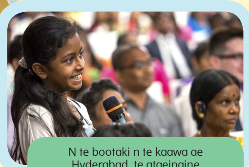
N te bootaki n te kaawa ae Hyderabad, te ataeinae aio e reke ana tai n titirakina Unimwaane Bednar te titiraki.

"Ngkana I mwamwananga n te aonaaba, aaba aika mwaiti aika I kawari, aika mwaiti aomata a mwaiti kakabwaia aika I karekei, I kunea bwa ni kabanea aaba aomata titebo aroia."