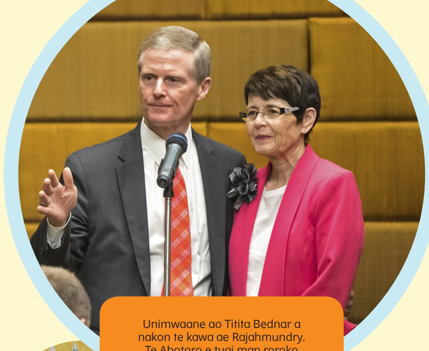
Unimwaane ao Titita Bednar a nakon te kawa ae Rajahmundry. Te Abotoro e tuai man roroko ikekei mai mwaina.