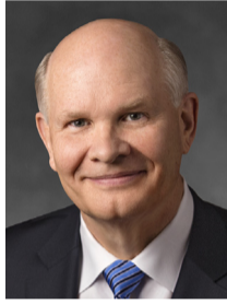
Dale G. Renlund