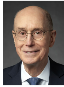
Henry B. Eyring Kauoman ni Kauntira