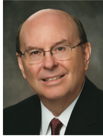
Quentin L. Cook