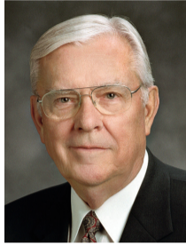
M. Russell Ballard