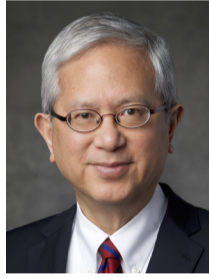
Gerrit W. Gong