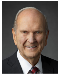
Russell M. Nelson Te Beretitenti