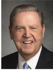
Jeffrey R. Holland