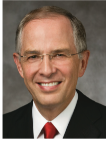
Neil L. Andersen