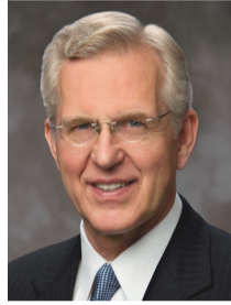
D. Todd Christofferson