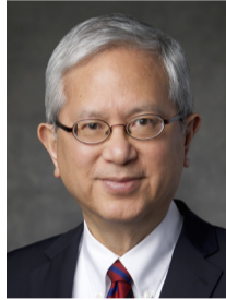
Gerrit W. Gong