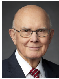
Dallin H. Oaks Tokoni 'Uluakī