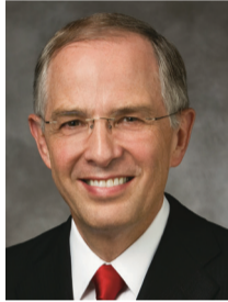
Neil L. Andersen