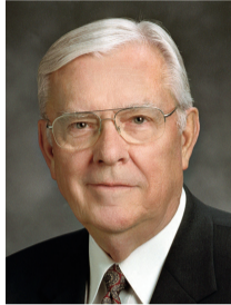
M. Russell Ballard