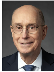
Henry B. Eyring Tokoni Uá