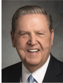
Jeffrey R. Holland