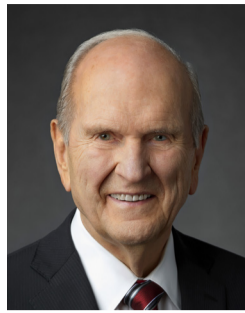
Russell M. Nelson Palesitēni