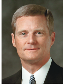
David A. Bednar