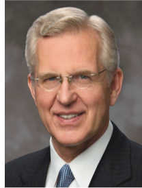
D. Todd Christofferson