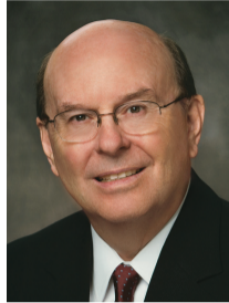
Quentin L. Cook