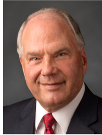
Ronald A. Rasband