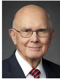
Dallin H. Oaks Tauturu hō'ē