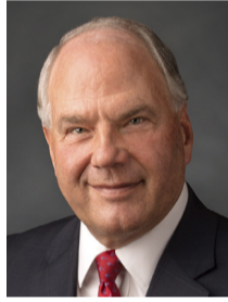
Ronald A. Rasband