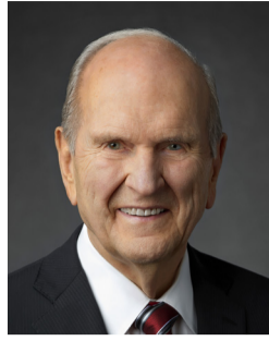
Russell M. Nelson Peresideni