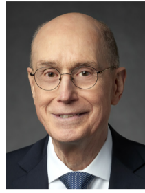
Henry B. Eyring Tauturu piti