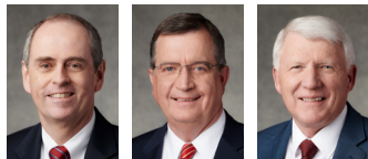
Milton Camargo Tauturu hō'ē, Mark L. Pace Peresideni, Jan E. Newman Tauturu piti