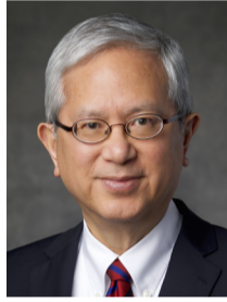
Gerrit W. Gong