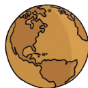
jerbal in mijenede