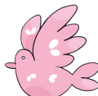
menin letok eo an Jetōb Kwojarjar