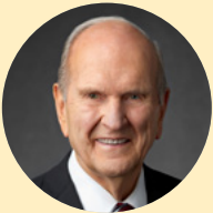
By President Russell M. Nelson