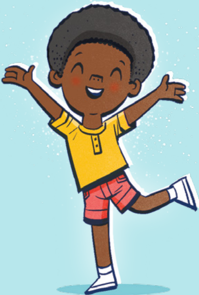
Help you be free from harmful habits.