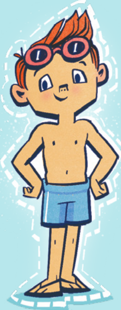
Protect your body.