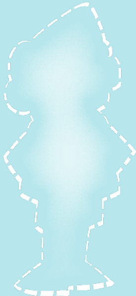
Protect your spirit.

Remember, God and His angels are always there to help you. ● Adapted from "Face the Future with Faith," Ensign or Liahona, May 2011, 34–36.