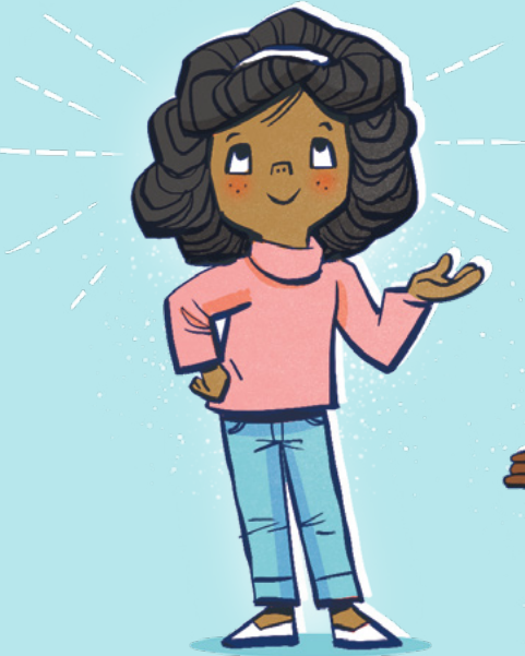
Bless you with light and joy.

You are a child of God. God gives us commandments to bless us and bring us joy. Sometimes people pick which commandments they will keep and which ones they won't. Trying to obey all of God's commandments will: