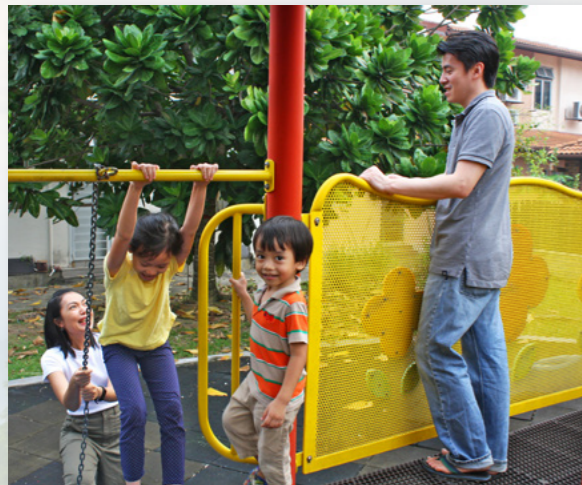
Keluarga means "family" in Malay. This family likes to play together at the park.

Malaysia is a beautiful country in Southeast Asia. There are about 10,000 members of the Church and 33 branches in Malaysia. The Church there is small but strong!