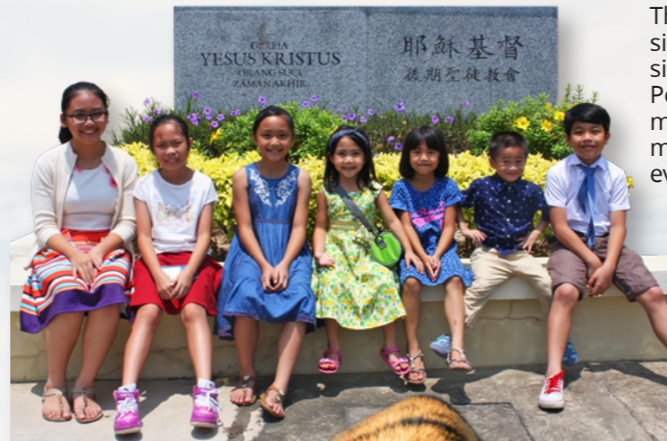
These Primary children are sitting in front of a Church sign in Malay and Chinese. People in Malaysia speak many languages. At church, members help translate so everyone can understand.