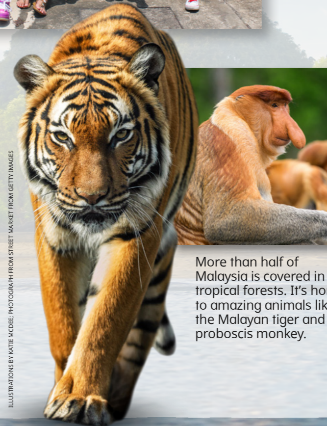
More than half of Malaysia is covered in tropical forests. It's home to amazing animals like the Malayan tiger and the proboscis monkey.