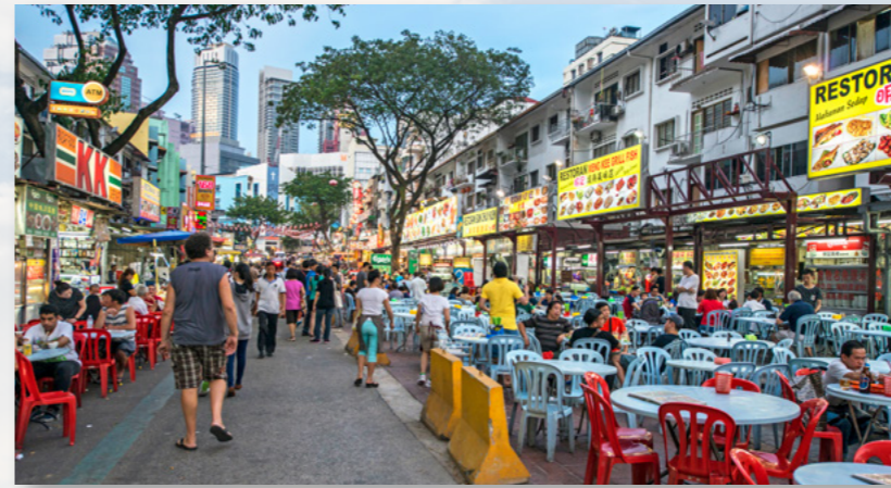
Families in Malaysia like to go out to eat together. People can buy street food all day and night.

Hi! We're Margo and Paolo. We're visiting Malaysia!