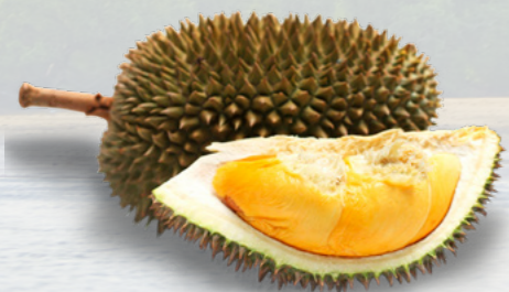
Durian is the strongest-smelling fruit in the world! Many people in Malaysia love this creamy fruit. It's used to make candy, ice cream, and other treats.