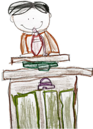
Isabella B., iiō 5, Guatemala, Guatemala