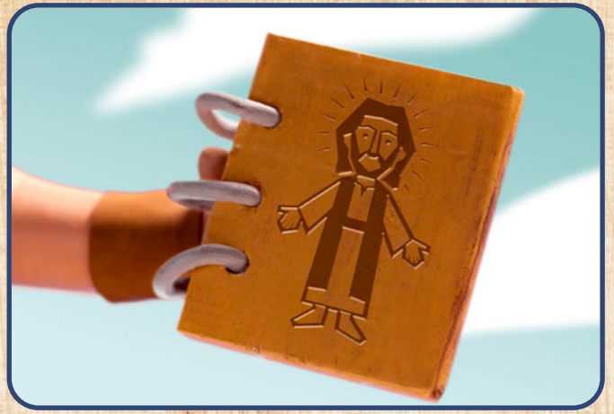
"And even though it's in five years, and though it's far away, the sun will set, the night begin, but be as bright as day."