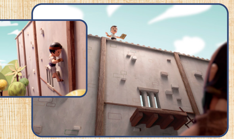
But Samuel would not give up. He had to let them know. He climbed atop the city wall and called to them below.