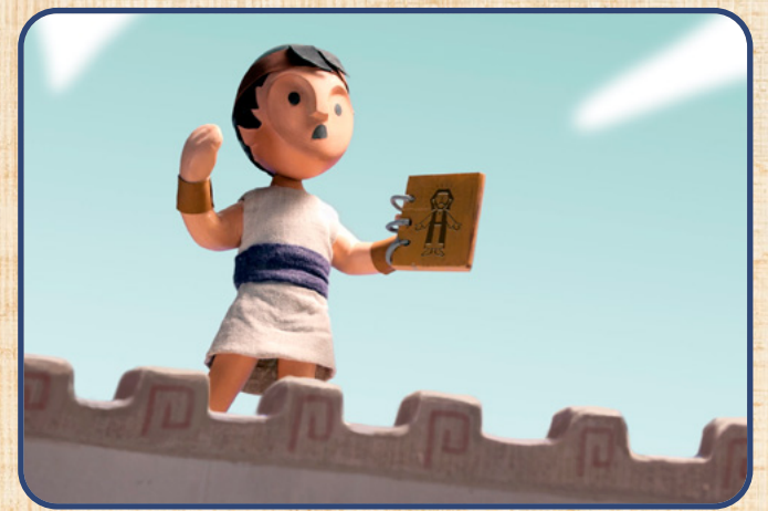
"In just five years the Lord will come, upon a starlit night, to save mankind from all their sins, and give the world His light."