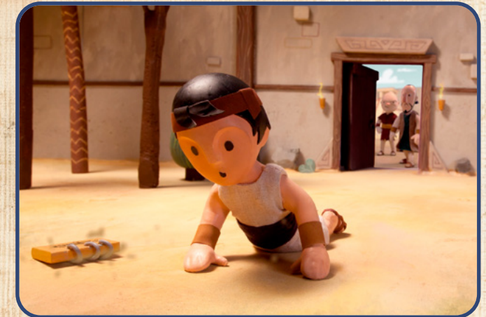
The people didn't listen. Their hearts were full of doubt. So they took Samuel to the city gate and threw him out.