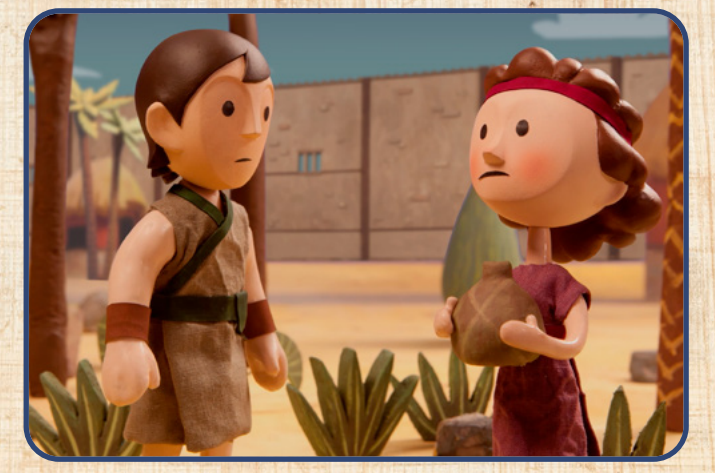
The faithful waited, breathlessly, in hopes they would behold—the star, the light, the promises, more precious far than gold.