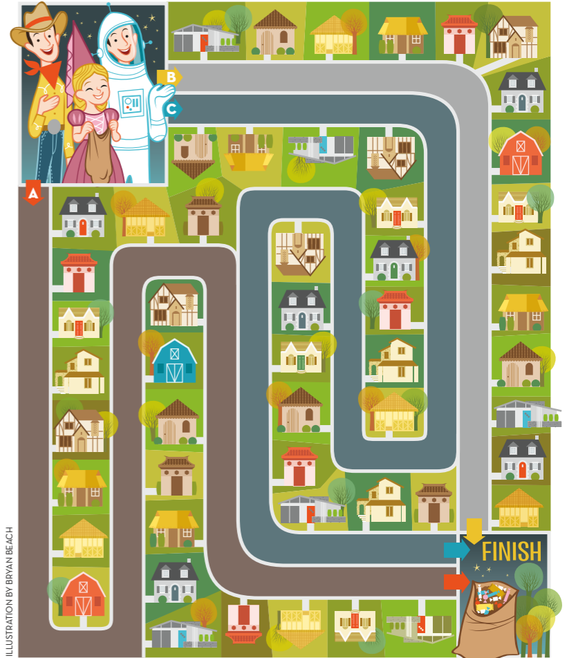
ILLUSTRATION BY BRYAN BEACH

These twin brothers have decided it's the last year they can go trick-or-treating with their little sister. They want to make sure she gets the maximum possible candy haul. Which proposed path will take them by the most homes?